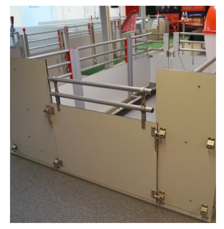
FUNKI FIBER with the gate in full width

Made of massive compact panels - specially designed for weaners and finishers